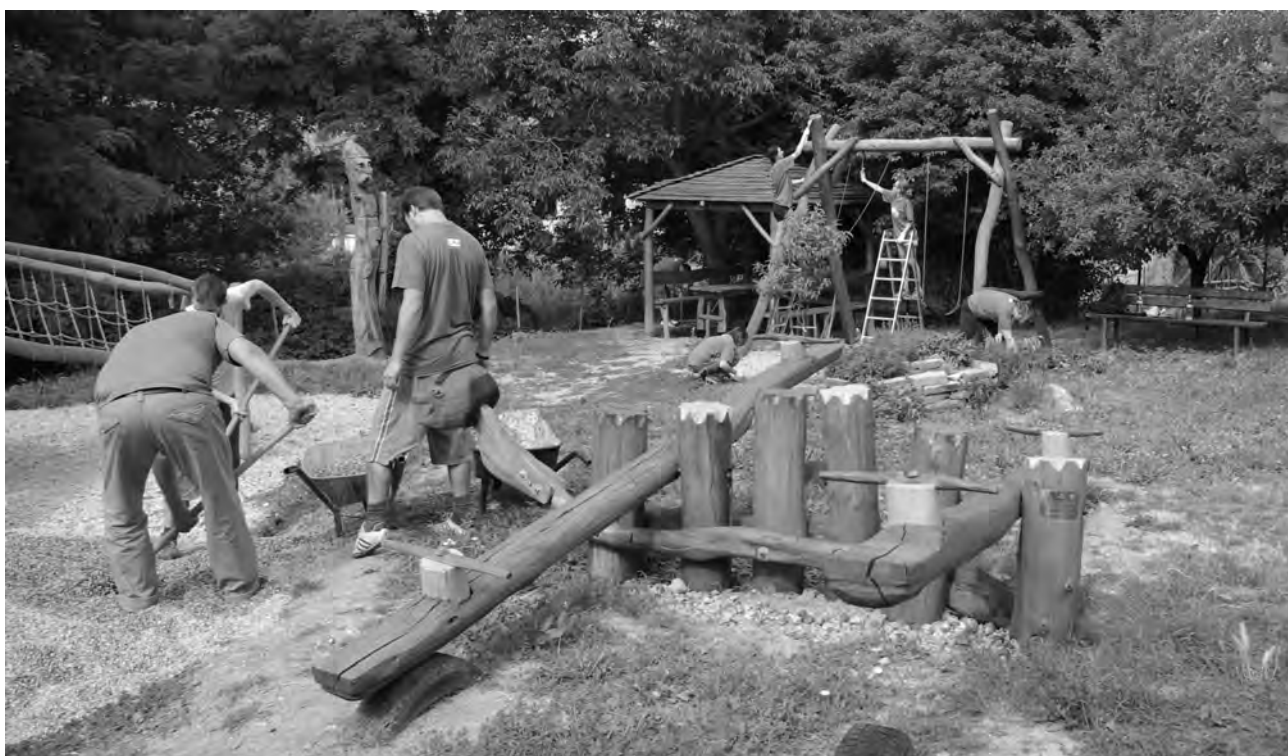
Občianske združenie Pajštún

We would like to thank all our donors and partners for their support, generosity and expressed trust.